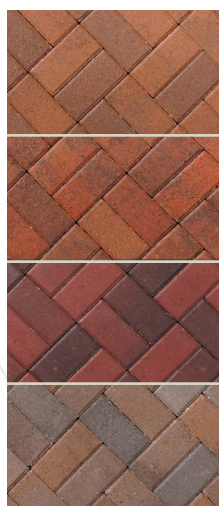
AUTUMN HICKORY BLEND