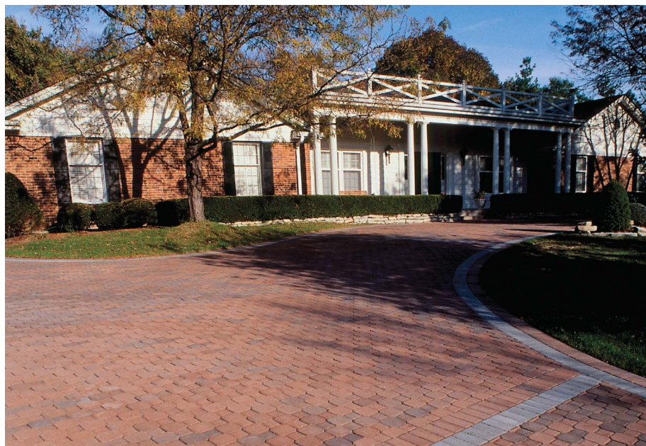
Uni-Decor combines two distinct shapes in one paver for a timeless pattern.

For a simple paver with an attractive, easily-installed pattern choose Uni-Decor. The two different but compatible shapes that make up the Uni-Decor paver style allow for a pleasing pattern with absolute simplicity of installation. For a diamond-like pattern try installing Uni-Decor at a 45° angle to the edge of your installation.